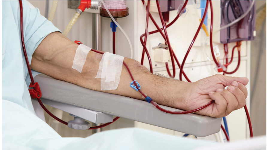
The circulation of health technologies is one area of new research that could be supported by the Pembroke Challenge.